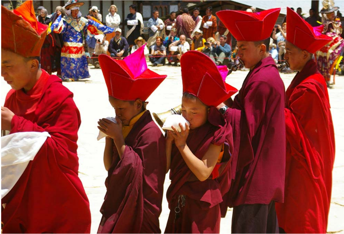
" Monks in the Festival"

Buddhism has always played an important role in the history of the country in the way of life of its peoples. It was Guru Rinpoche in 18th century AD who introduced Buddhist teachings in Bhutan. He was the one who laid the foundation of one of the most important and unifying forces that has sustained the Bhutanese people and contributed to the evolution of their unique cultural and religious traditions.