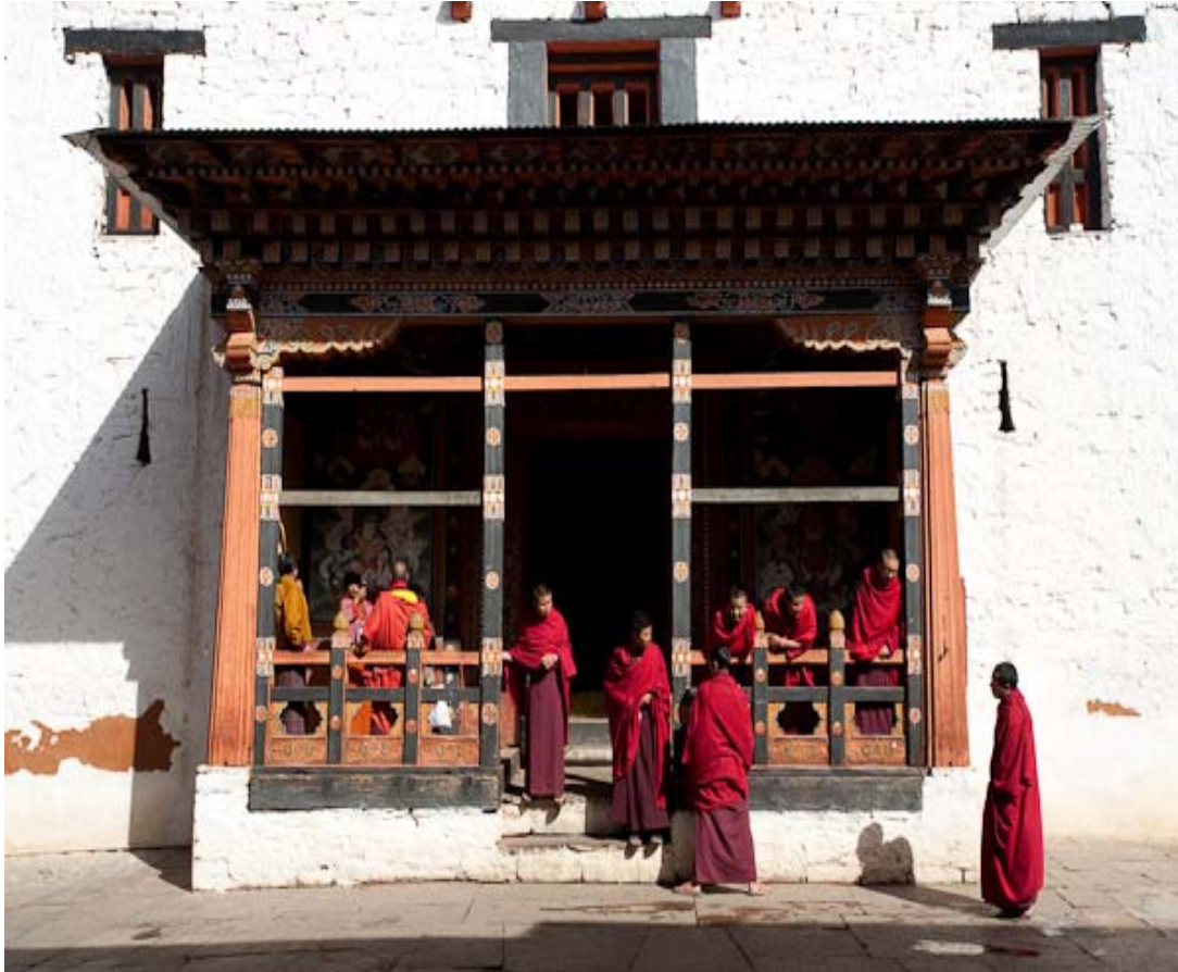
“Monks standing at the entrance of the Temple”

ADVENTURE - CULTURE - ECO TOURS - COMMUNITY TOURS - FESTIVAL - ARCHITECTURE - HISTORY - RELIGION