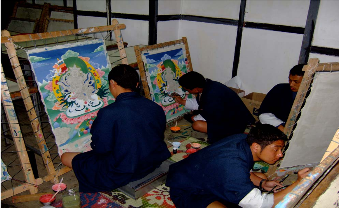
“Students painting the religious Thangka”

Bhutanese textiles are renowned for their distinctive colors and patterns, which have been inspired by nature. The use and contemplation of colors and pattern in art and craft also have religious significance, as they form an integral part of worship and practice. Because of its high profit and national significance, weaving receives Royal Patronage.